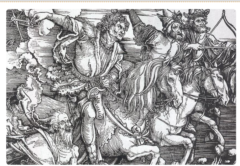
#3 | Albrecht Dürer | Four Horsemen of the Apocalypse | 1497-98 | woodcut 39 \times 28 cm | The Metropolitan Museum of Art: New York, NY