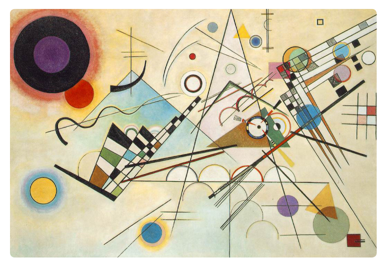
#1 | Vasily Kandinsky | Composition 8 | 1923 | oil on canvas 140 × 201 cm | Guggenheim Museum: New York, NY