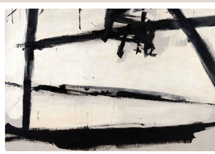
#6 | Franz Kline | Painting Number 2 | 1954 | oil on canvas 204 × 272 cm | Museum of Modern Art: New York, NY