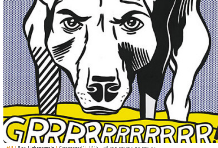
#4 | Roy Lichtenstein | Grrrrrrrrrr!! | 1965 | oil and magna on canvas 173 \times 142 cm | Guggenheim Museum: New York, NY