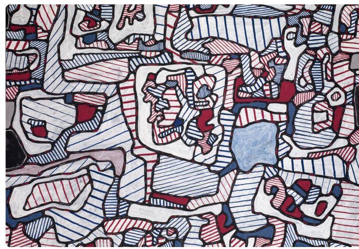
#2 | Jean Dubuffet | Site Inhabited by Objects | 1965 | acrylic on canvas 130 \times 162 cm | Tate Collection: London, United Kingdom